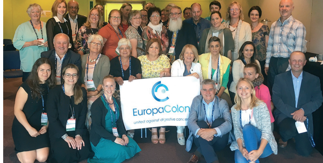
EuropaColon's 2nd Annual Masterclass June 2017 - Barcelona

Video and presentations are available at: www.europacoln.com